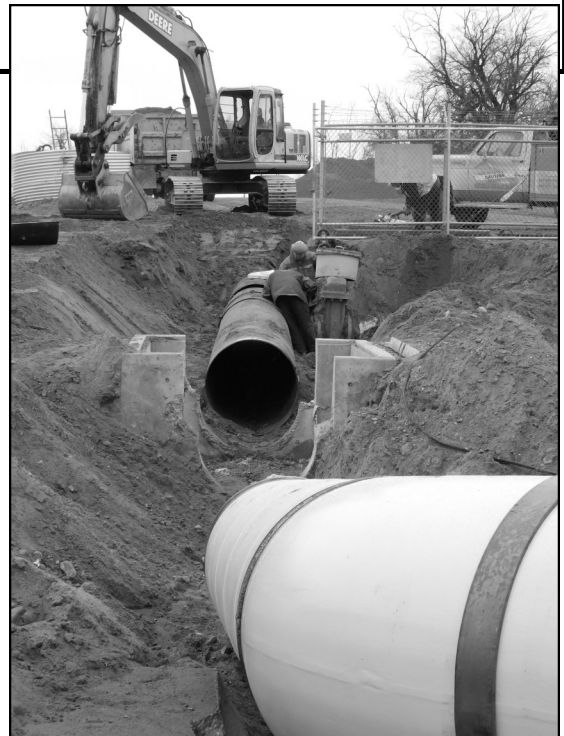
Pictures to left show the pipe waiting to be installed on Lateral 7 along Rippee Road. Above is the 36-inch pipe manifold at the Irrigon Pump Station being replaced.