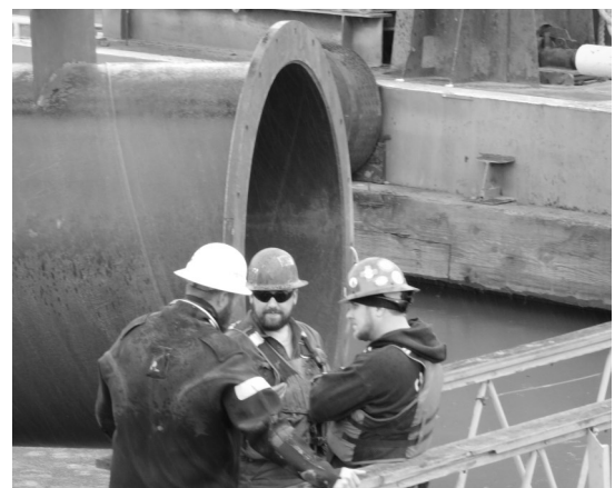
Right, construction crew standing in front of pipe to be installed in the river.