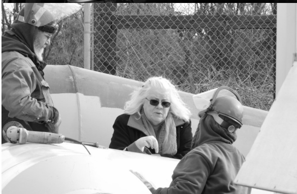
Left, planning meeting on-site.